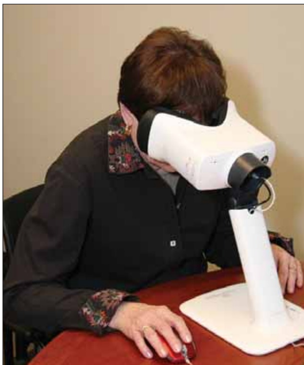
Figure 1. Patients complete a brief exam on their ForeseeHome AMD Monitor each day at home.

monitoring with PHP should detect most cases of CNV of recent onset with few false-positive results at a stage when treatment usually would be beneficial.